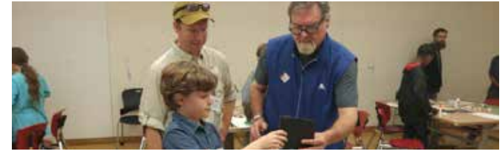
AIA Atlanta, Grade School Design Workshop, 2016 Gerry explaining biomimicry to young students