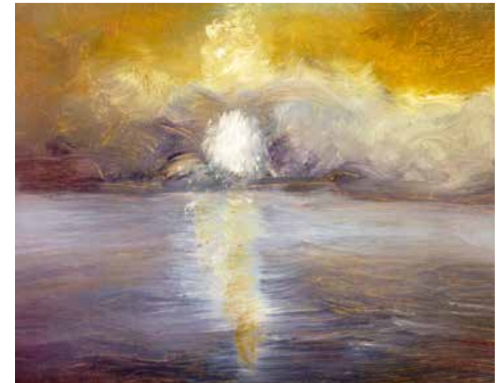
Oil Painting By Gerry Cowart