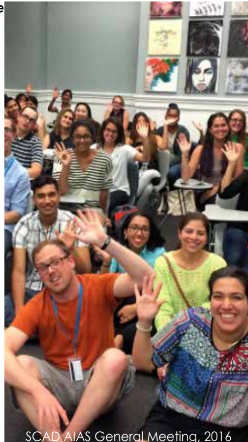
SCAD AIAS General Meeting, 2016