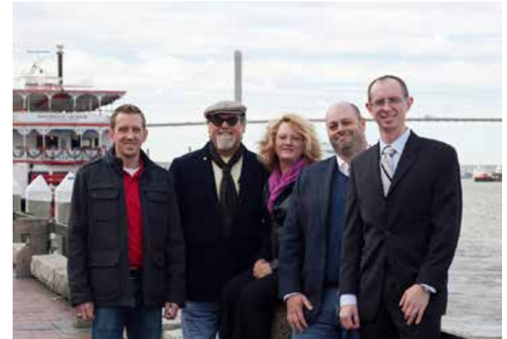
AIA Savannah Leadership ,