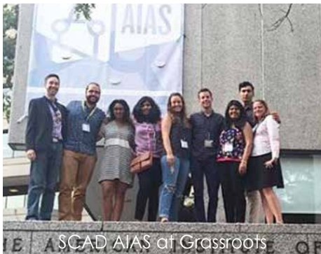
SCAD AIAS at Grassroots