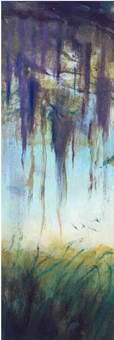
Oil Painting By Gerry Cowart