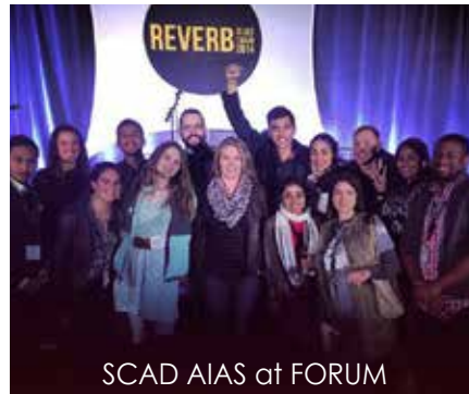
SCAD AIAS at FORUM