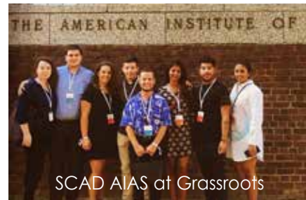
SCAD AIAS at Grassroots