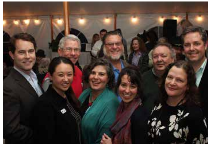
Ogeechee Riverkeeper , Board of Directors